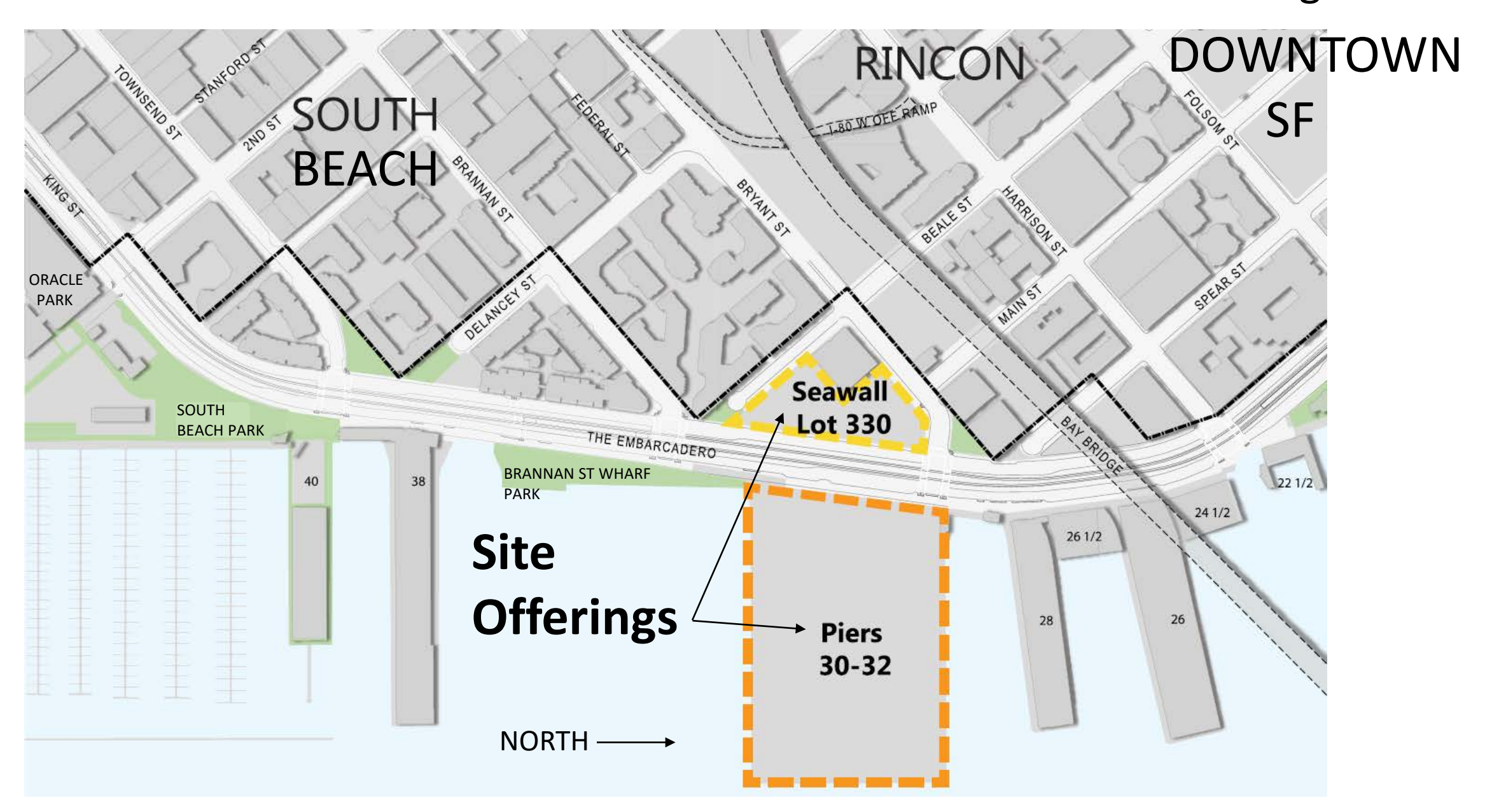
EXHIBIT 2: Piers 30-32 and Seawall Lot 330 Site Location and Setting