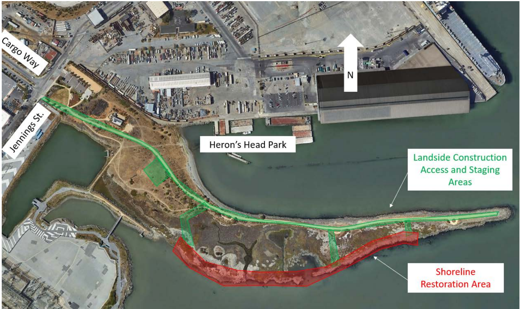
EXHIBIT A AREA OF WORK LOCATION MAP