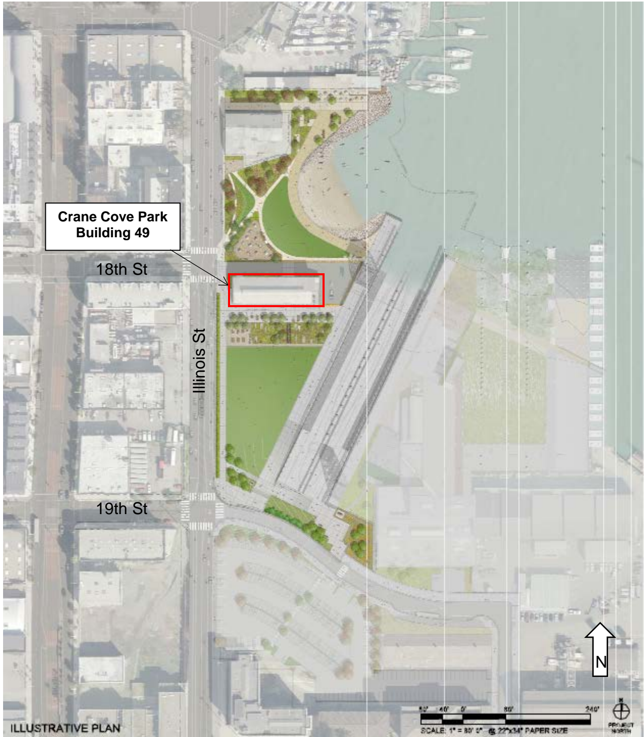
EXHIBIT A AREA OF WORK LOCATION MAP