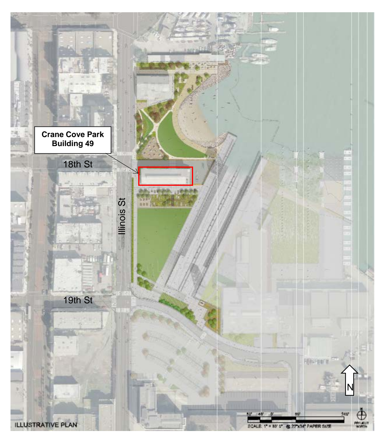
EXHIBIT A AREA OF WORK LOCATION MAP