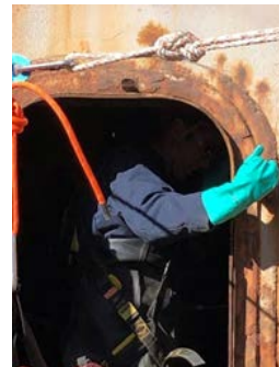
Confined space entry and rescue support