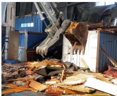
Hazardous materials abatement and demolition over land and water