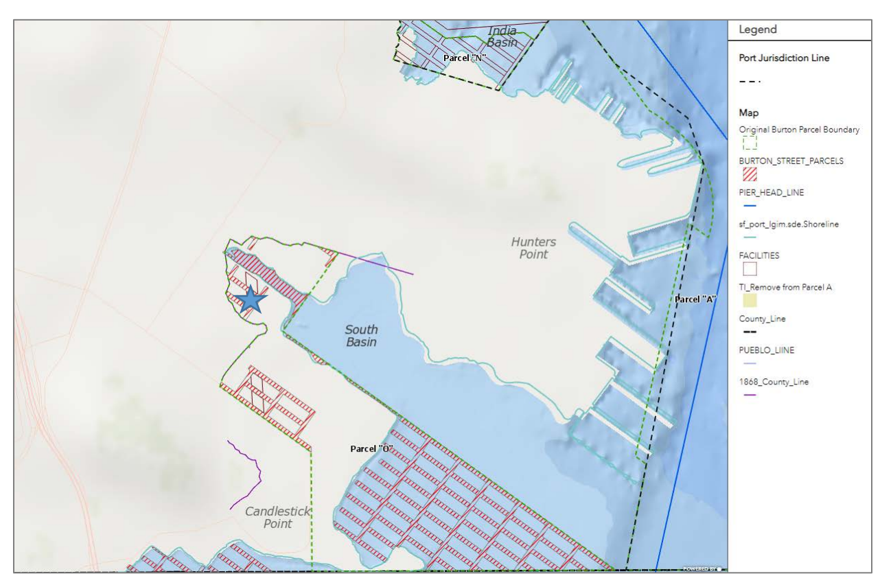
Figure 2. Port Land in Project area, indicates Project site The star is EAST of the project site