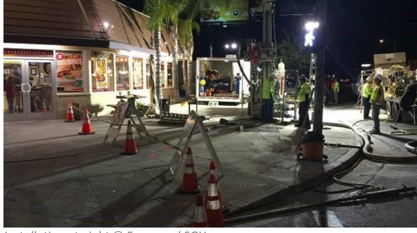
Installation at night